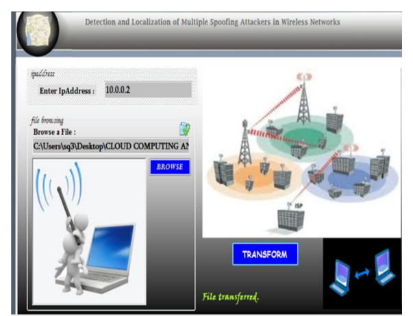
Figure 1. Localization of Attackers

receiver node to create txt node refer Figure 1 for the same.